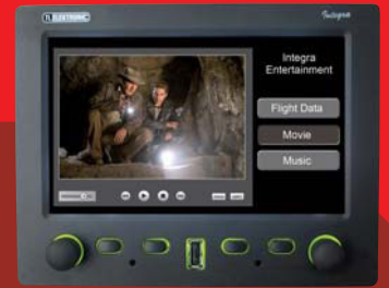
EFIS/EMS REMOTE DISPLAY TL-6824